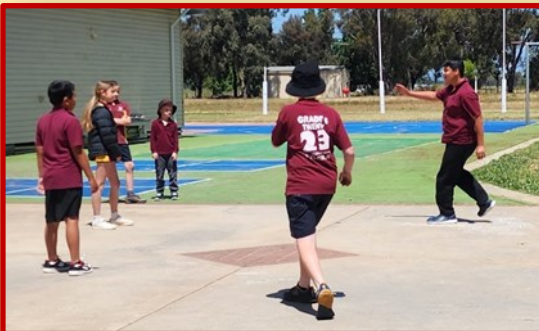
Down ball continues to be popular at lunchtimes.