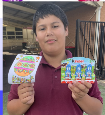
3RD TYLER A