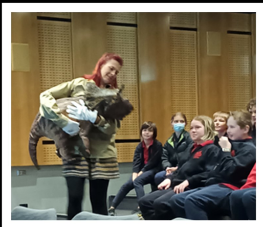
That's a baby Triceratops she's holding!