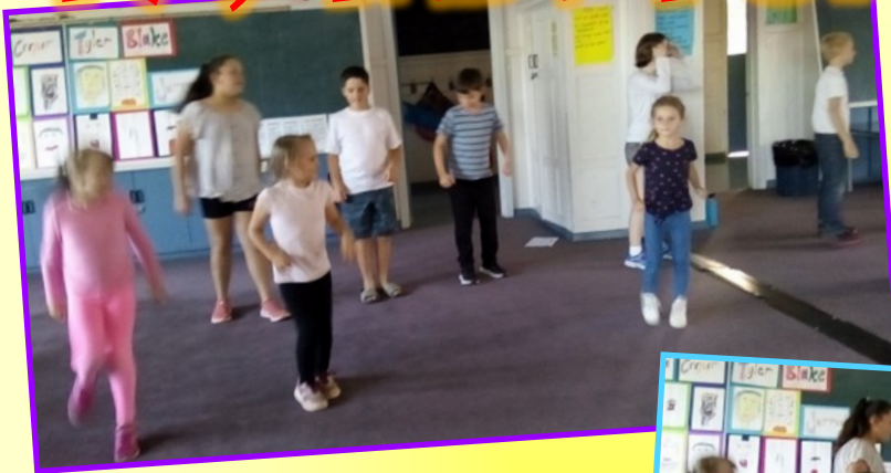
Body Percussion performance