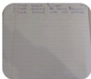
Cerece 19 ho...

JUST SOME OF OUR HARD-WORKING STUDENTS WITH THEIR WORK SUBMITTED ON CLASS DOJO