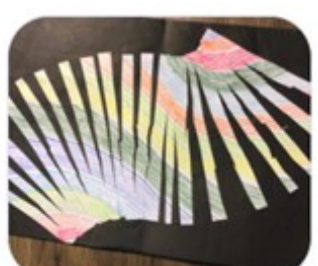
Ashton 19 hou...