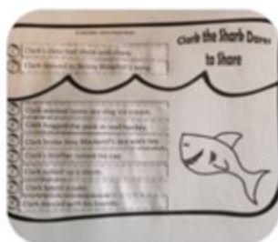
Bridie 19 ho...